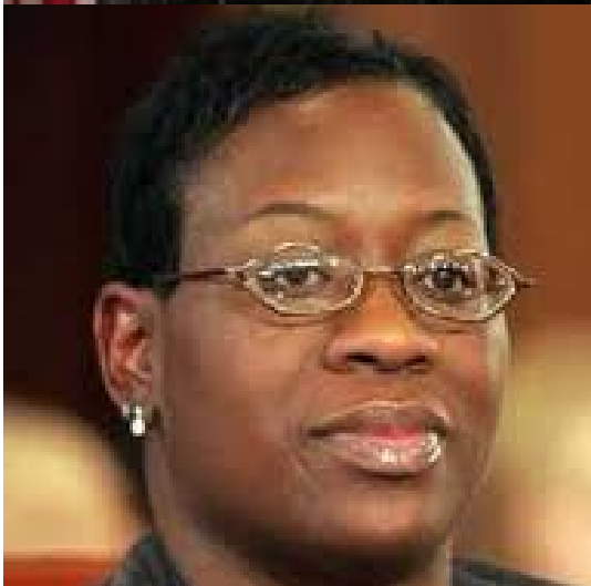
U.S. Rep. Marcia L. Fudge (D-OH) and Ohio State Sen. Nina Turner (D-25)