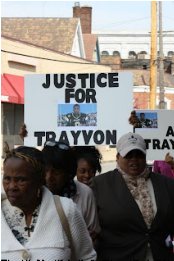
The Rev. Martin Luther King Jr. Memorial March, April 15 community activists (top right) at the

Wednesday, 18 April 2012 19:42 - Last Updated Thursday, 19 April 2012 02:21