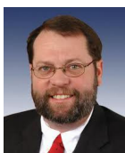
U.S. Rep. Steve LaTourette (R-OH)

"The staggering number of blighted homes is beyond what communities can handle alone," said